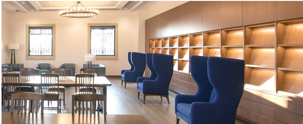
Journals Reading Room

SPACES Copley Library's 2021 renovation created a variety of spaces. The building contains 1,000 user seats, 25 group study rooms, 3 seminar rooms, 3 classrooms, the Scholars Livingroom, the Journals Reading Room, and collaborative spaces on the lower level. Faculty can schedule the three seminar rooms. The group study rooms are for students only. The Faculty and Graduate Student Reading Room is located on the second floor in the back of the library. For more information about spaces, see https://www.sandiego.edu/library/visit/spaces.php