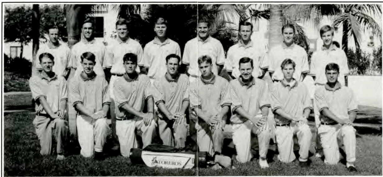
1993-94 USD Toreros: