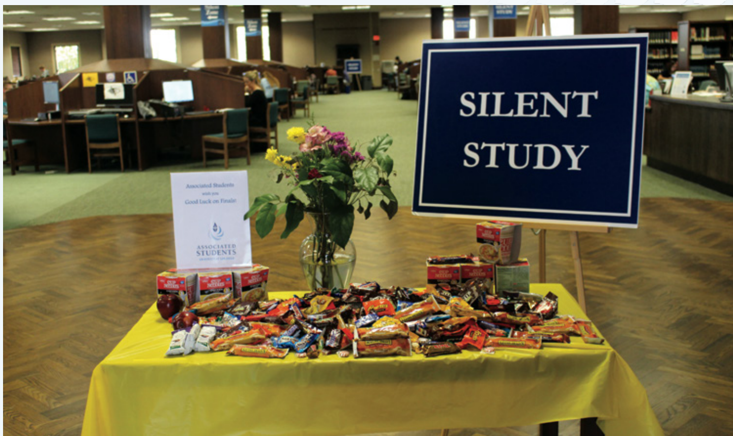
Thank you to Associated Students for providing snacks to students during finals.