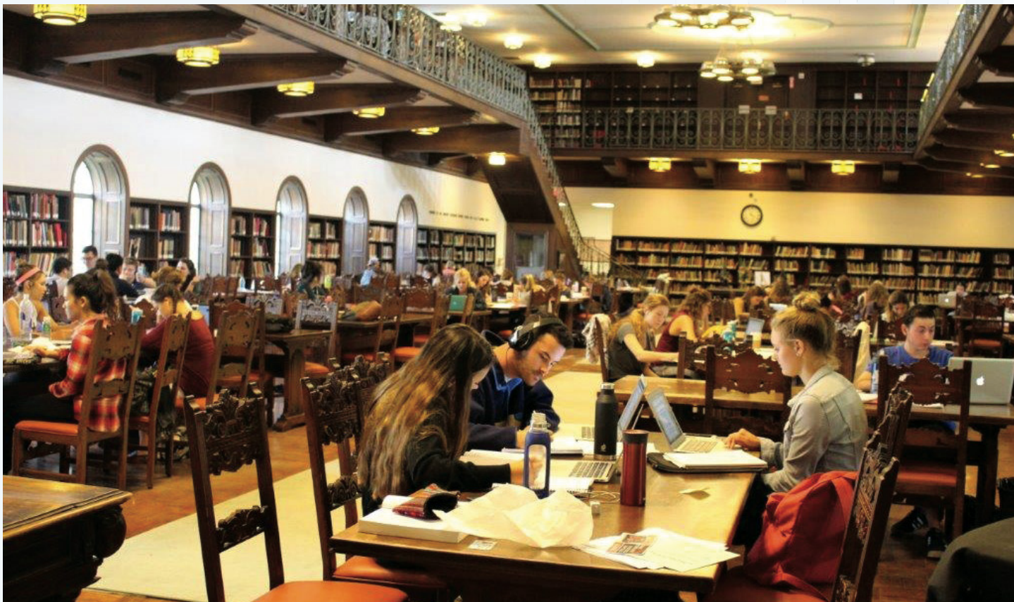
Students studying in the Mother Hill Reading Room during Spring finals 2016.