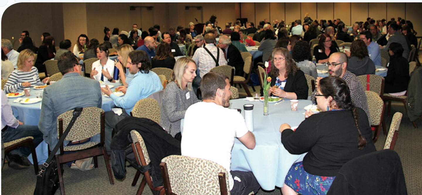
Participants enjoying the Symposium lunch at the Kroc Institute for Peace and Justice