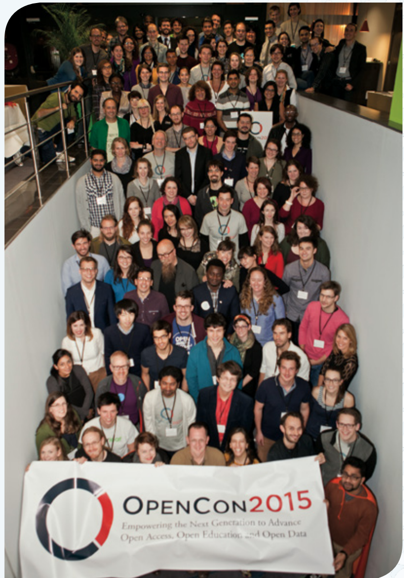
OpenCon 2015

We are immensely grateful to USD for providing the travel scholarships necessary to attend, and we look forward to continuing to share the lessons and experiences of OpenCon with the USD community.