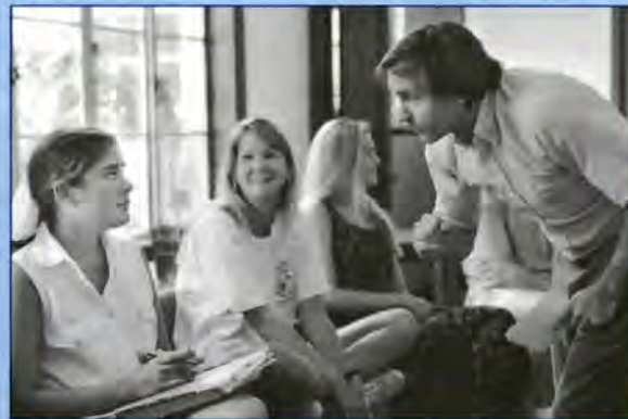
Ninety-four percent of USD's faculty members have a Ph.D. or the equivalent terminal degree in their field.