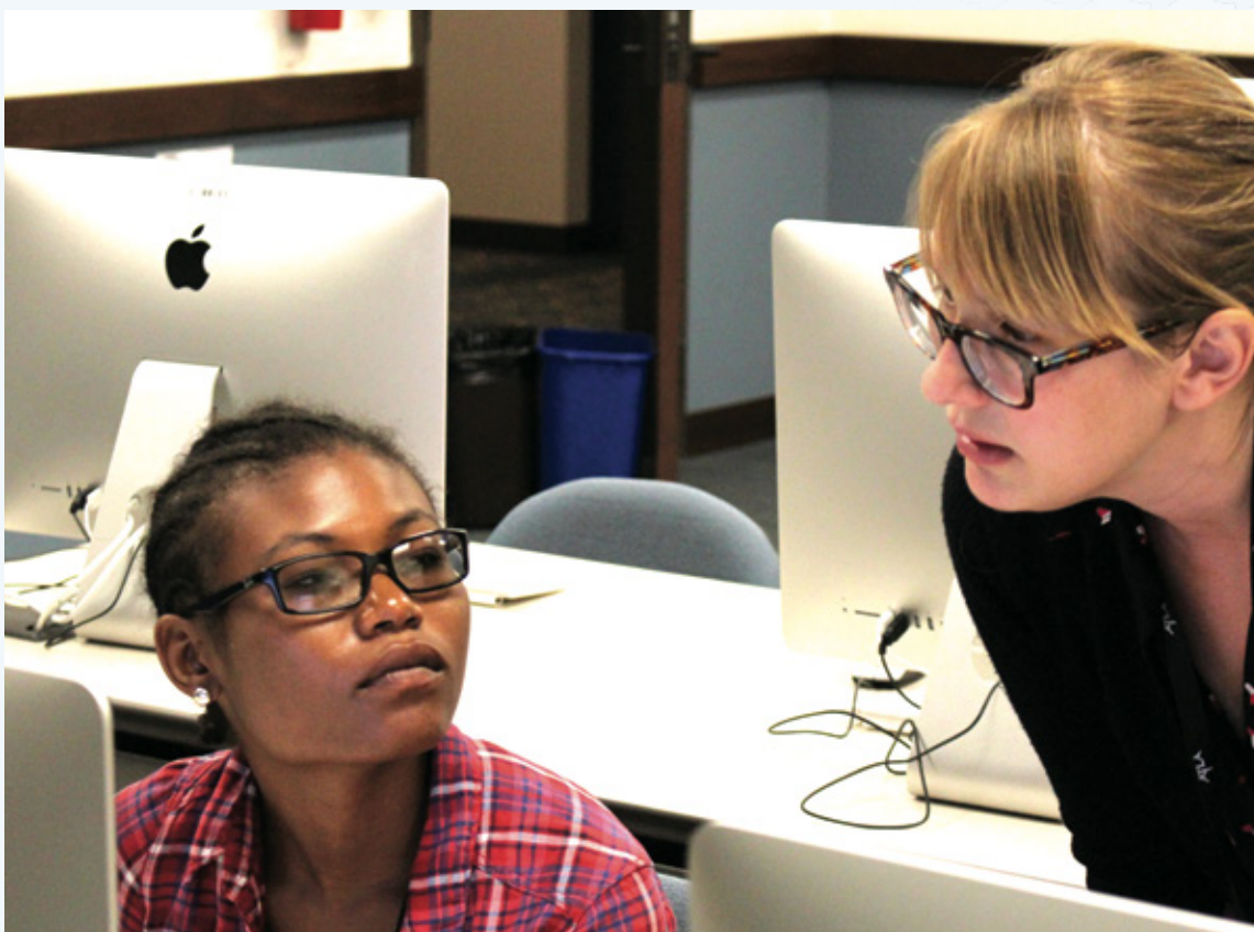
Adkins offers individual research assistance to each of the STEAM Team scholars.