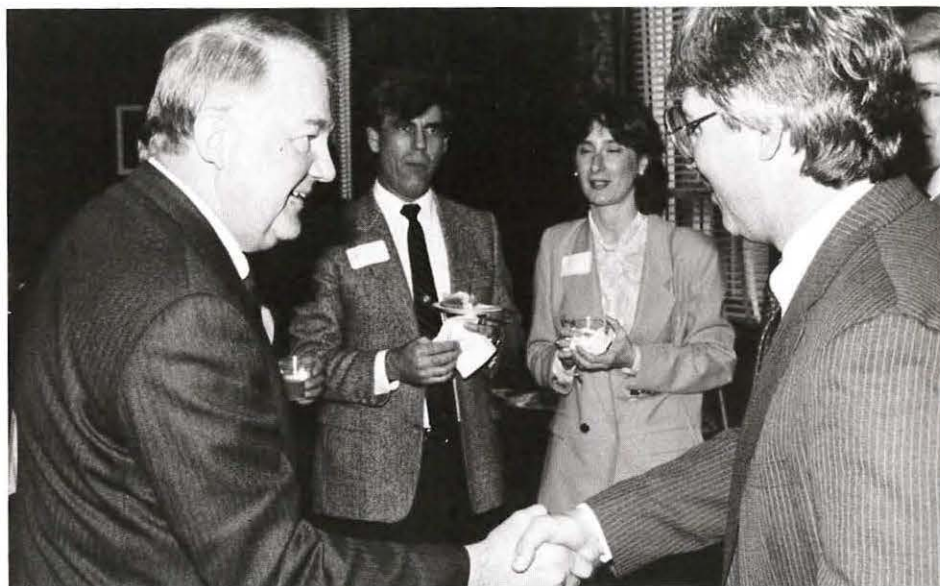
Washington, D.C. area alumni, parents and friends gathered this spring for a reception at the Department of Justice that was hosted by Attorney General Edwin Meese.

The following alumni were instrumental in organizing these receptions: