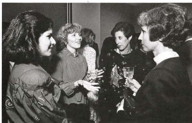
Members of the class of 1976 catch up on news about classmates during the cocktail reception.