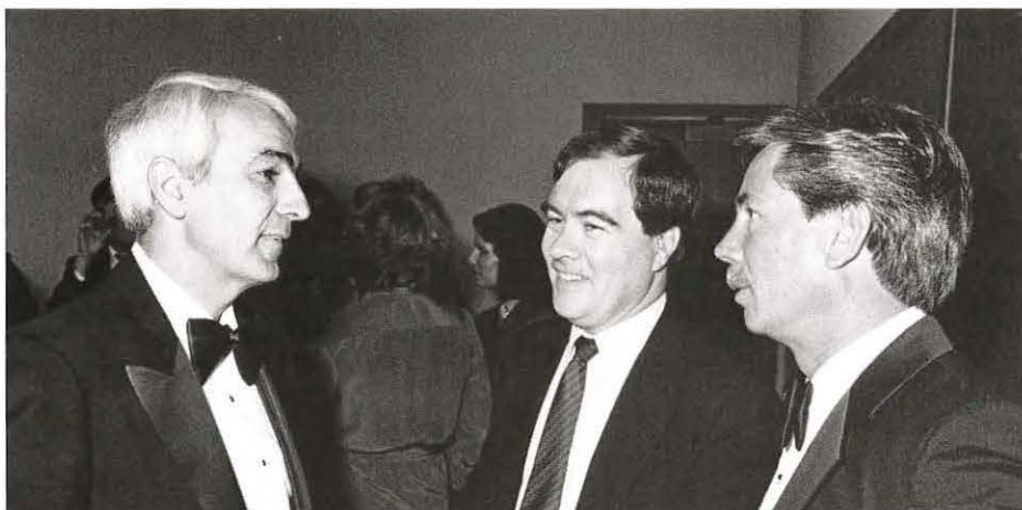
Class of 1976 graduates enjoy their reunion reception in March.

The alumni Board of Directors serves as an advisory group to the Law School and offers educational, social and fund raising activities for students and alumni.