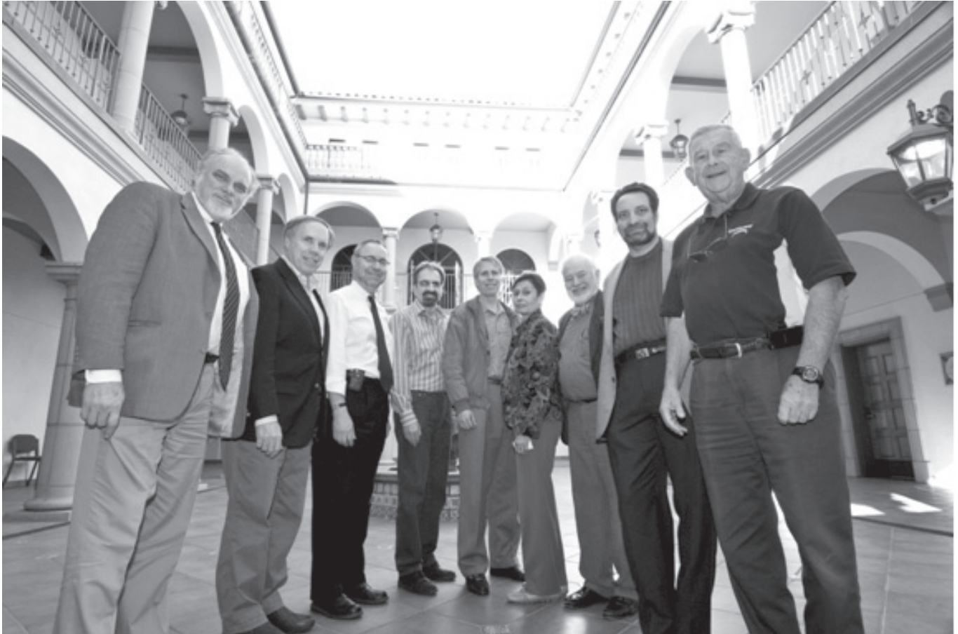
The CAI Council for Children: