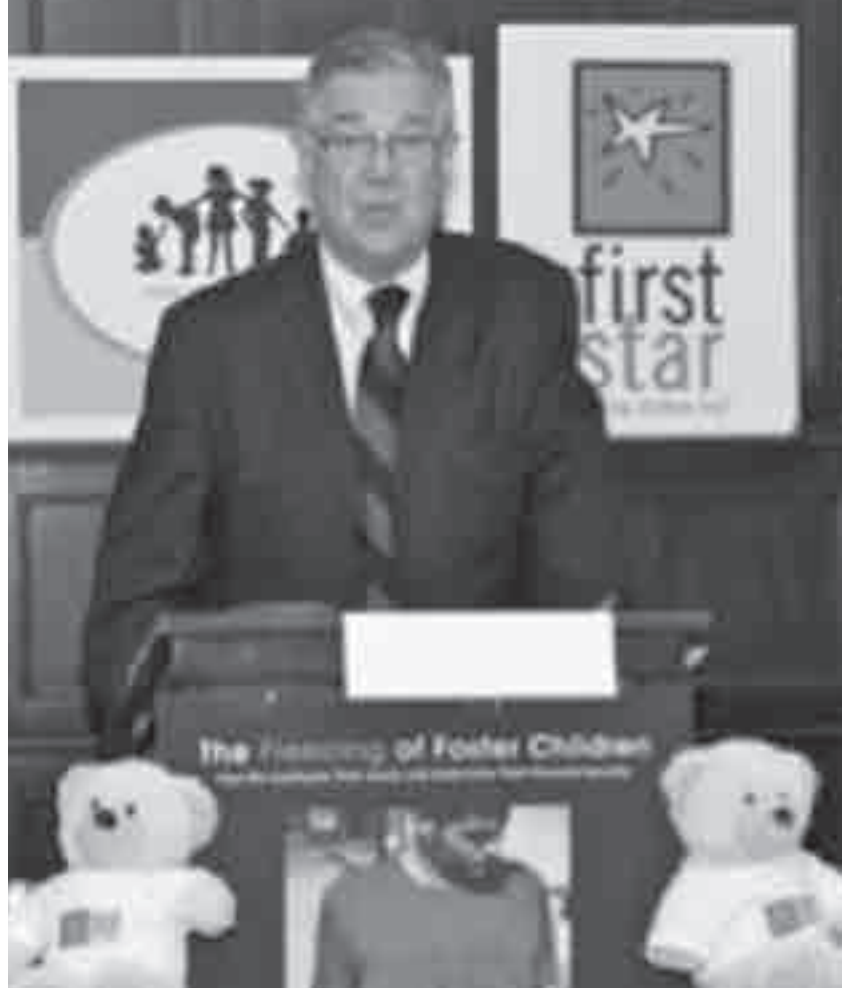
Rep. Pete Stark (D-CA) (above) and Rep. Jim Langevin (D-RI) (below) speak at CAI's Congressional briefing.

Also during 2011, CAI engaged in a number of other projects and activities as a result of the Fleeing report, such as participating in a forum held by the Federal Trade Commission and the U.S. Department of Justice to discuss child identity theft, during which government, business, non-profit, legal service providers, and victim advocates explored the nature of child identity theft and how to resolve child identity theft problems; collaborating with IDentityTheft911, an organization interested in assisting foster youth in identifying and resolving credit fraud and identity theft; and responding to a request from the Social Security Administration's Office of the Inspector General to discuss its upcoming nationwide investigation into the misuse of foster children's Social Security numbers.