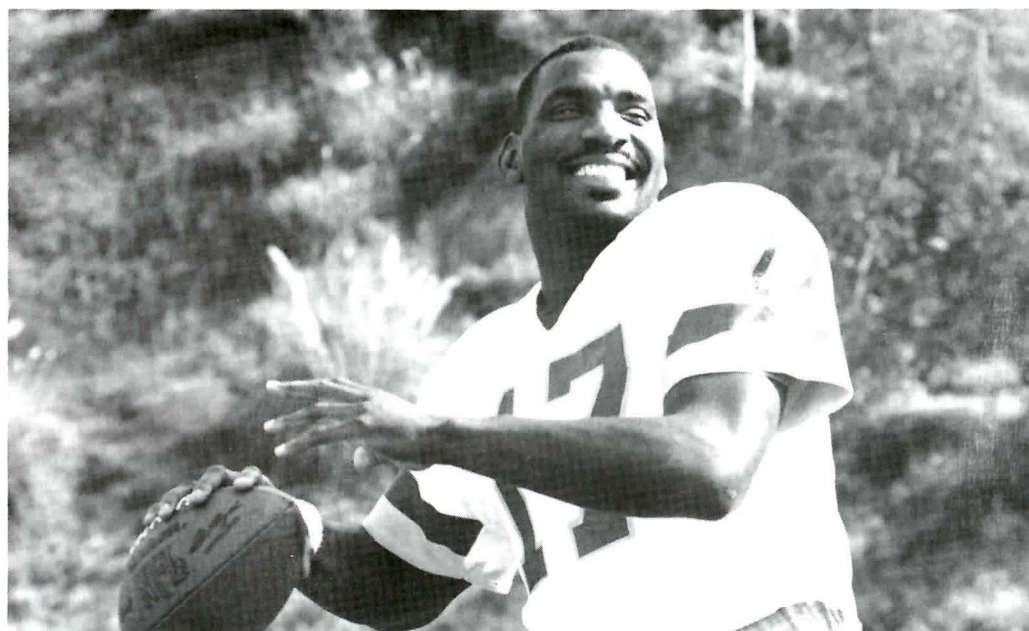
Washington Redskins' quarterback Doug Williams was smiling broadly two days before Super Bowl XXII as he practiced along with his teammates at USD's Torero Stadium. Williams' smile undoubtedly grew larger after the big game, won by the Redskins, 42-10.