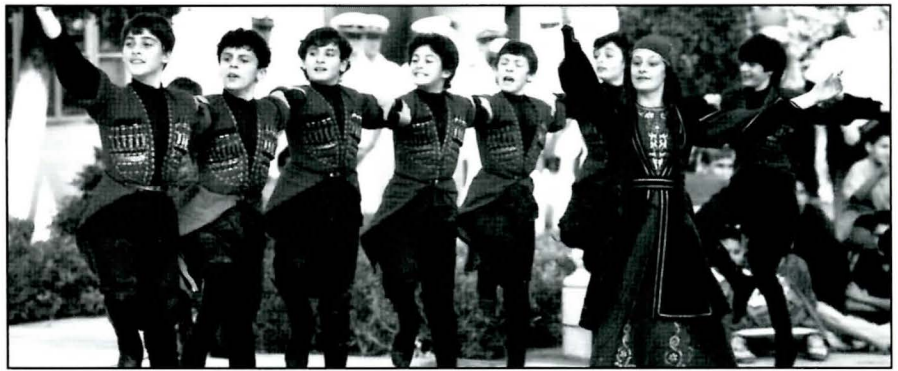
The San Diego Soviet Arts festival came to USD Nov. 7, when members of the Soviet Georgian Children's Dance Company performed for some 600 USD community members and local school children.