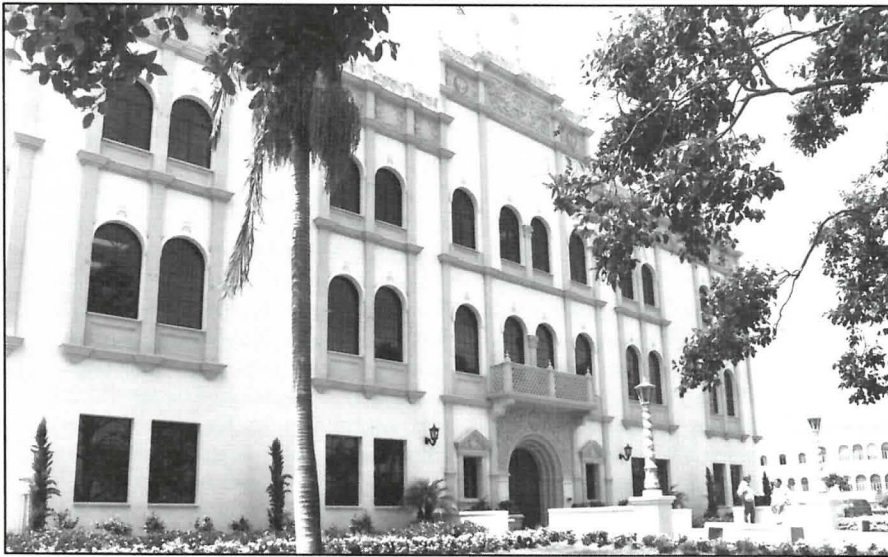
The recently completed Legal Research Center.