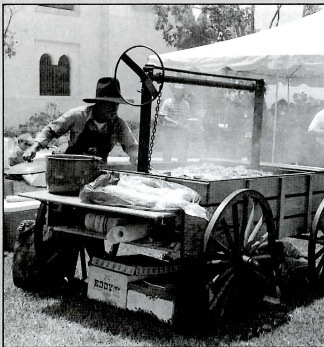
The Santa Maria Barbecue Company employees prepare the tasty grub for the seventh annual Staff Employee Appreciation Picnic.