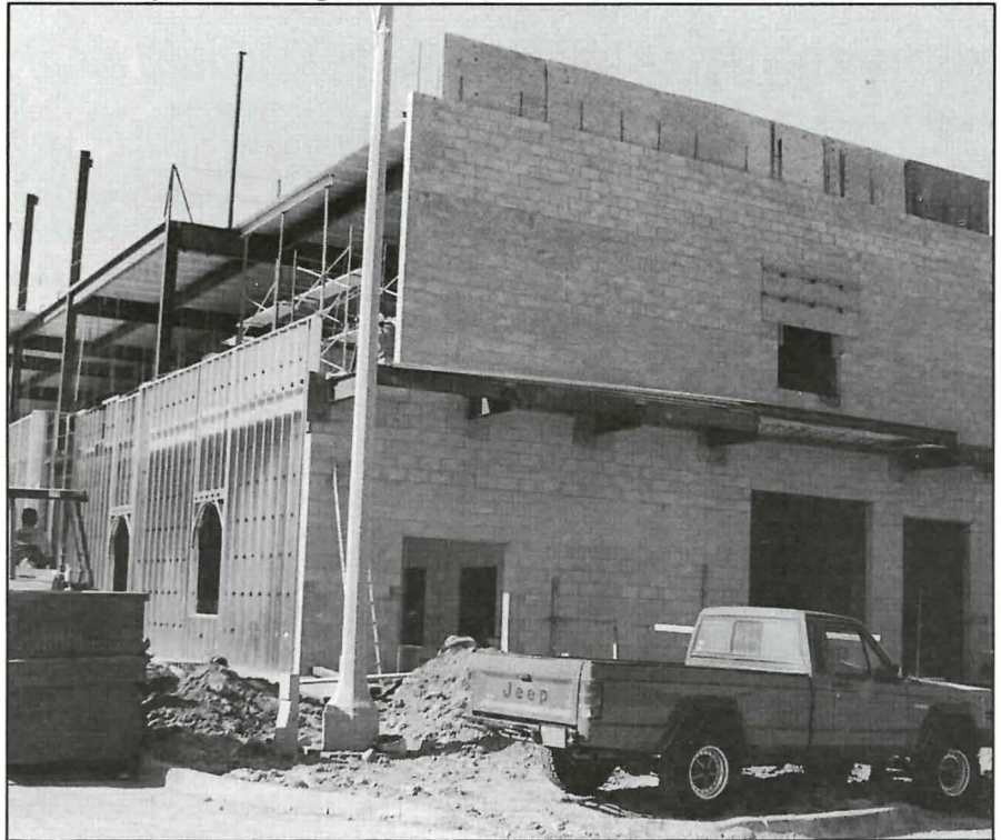
Construction is just over 50 percent complete on the new 45,380 square foot bookstore/academic building located behind Guadalupe Hall.