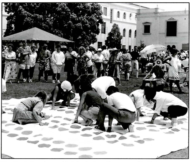
The Picnic People provided the food and fun games like Twister.

The Staff Employee Association would like to thank the following generous sponsors for providing door prizes for the picnic: La Casa Del Zorro, San Diego Hilton, Old Globe Theater, La Jolla Playhouse, The Hungry Hunter, San Diego Zoo and Wild Animal Park, El Tecolote, Bazaar Del Mundo, Subway Sandwiches, See's Candy, San Diego Ice Arena, Family Fun Center, Mann Theaters, Dominos, Alfonso's, Invader Cruises, Waldenbooks, Tower Record and Video, Ice Capades Chalet, TGIFridays, American Athletic Club, Old Town Flowers and Gifts, Kanaka's, Marriot, Harbor Excursions, USD Bookstore, Main Dining, Dining Services and Special Events.