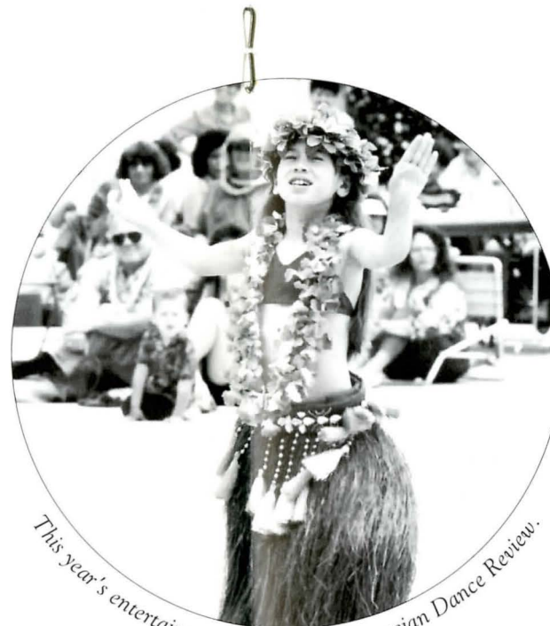
This year's entertainment included a Polynesian Dance Review.