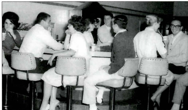
Sacred Heart Hall was the center of social life in USD's early days.

In addition to increasing the seating capacity to about 120, the renovation plans call for a permanent sound and lighting control booth, new flooring and a two-tiered backstage facility.