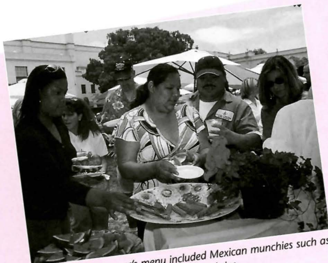
Fiesta Fare: This year's menu included Mexican munchies such as enchiladas, carne asada and beans and rice.