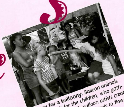
Looney for a balloony: Balloon animals were a big hit for the children, who gathered around to watch balloon artists create everything from favorite animals to flower hats.