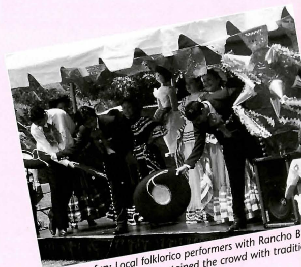
Folklorico fun: Local folklorico performers with Rancho B Vista Ballet Folklorico, entertained the crowd with traditional Mexican dances.