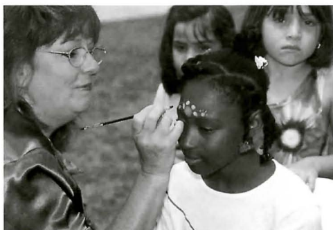
Facial expressions: Painting their cheeks and foreheads was a popular way for kids to add some extra color and sparkle to their faces at this year's fiesta.

T he USD Employee Recognition Picnic is always a celebration, but this year it wasn't just a party, it was a fiesta. More than 1,200 employees and their families jammed Copley Lawn for the June 25 event, which featured a best-salsa contest and activities for kids, including a jump-zone and face painting.