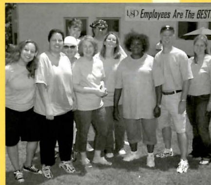
Members of the picnic committee worked behind the scenes to put on a jammin' Jamaica picnic.