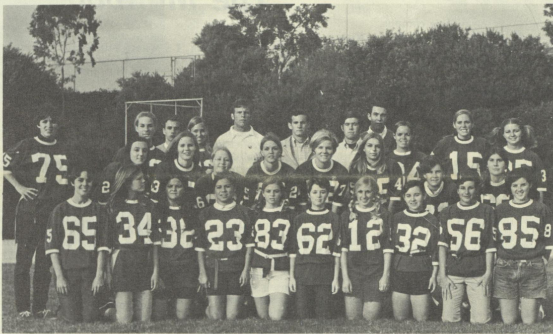
CREAM PUFFS —USD's Powder Puff team will engage girls from Cathedral High today. See photos on Page 3 and story on Page 4.