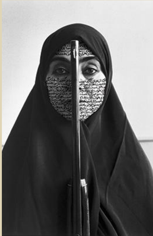
Rebellious Silence, 1994, Shirin Neshat