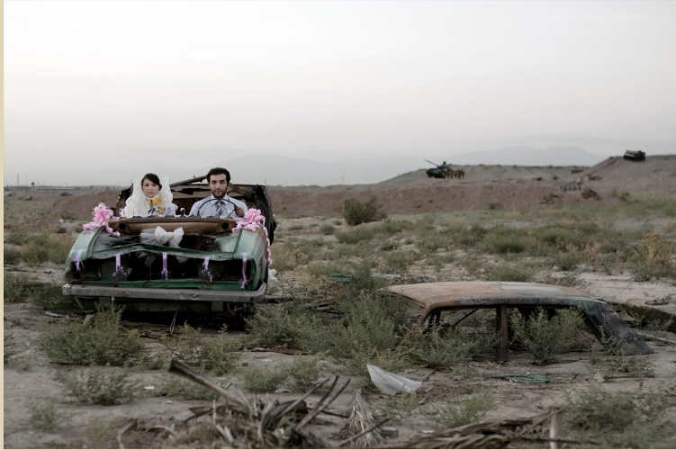
Untitled #5 , 2008, Gohar Dashti, Gohardashti.com