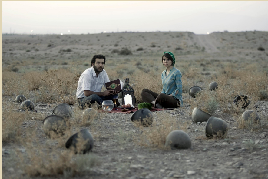
Untitled #7 , 2008, Gohar Dashti, Gohardashti.com