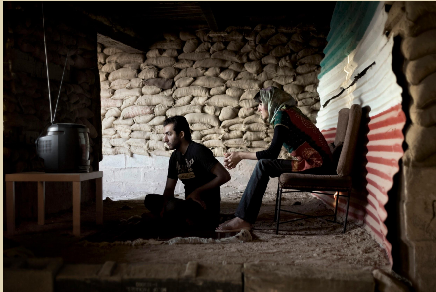
Untitled #1 , 2008, Gohar Dashti, Gohardashti.com